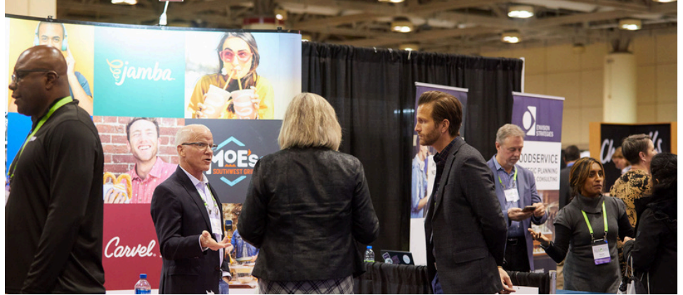
Exhibit Booth Pricing